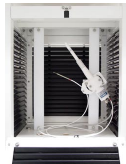
HMP155 in a Stevenson screen.

The HMP155 is especially designed for use in meteorological applications, such as synoptic and hydrological weather stations, aviation, and road weather. It is also suitable in a wide range of instrumentation, for example, recorders, data loggers, and laboratory equipment and monitoring.