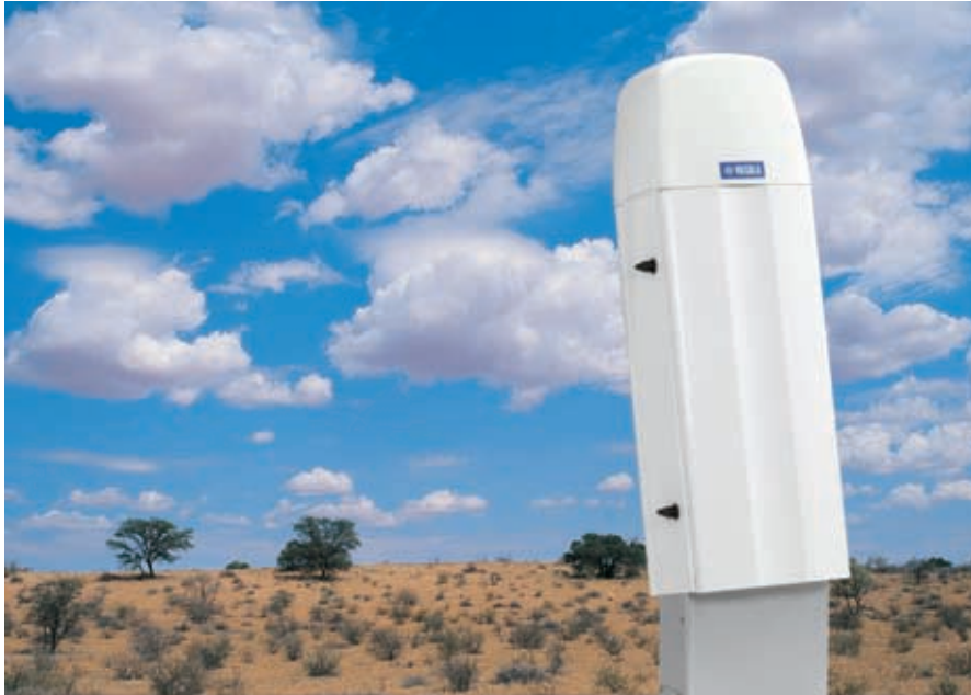
Vaisala Ceilometer CL31 measures cloud base height and vertical visibility in all weather – good or bad.

The Vaisala Ceilometer CL31 is a compact and lightweight instrument for cloud base height and vertical visibility measurements. It is able to detect three cloud layers simultaneously. The CL31 is ideal for aviation as well as meteorological applications where reliable detection of clouds is essential.