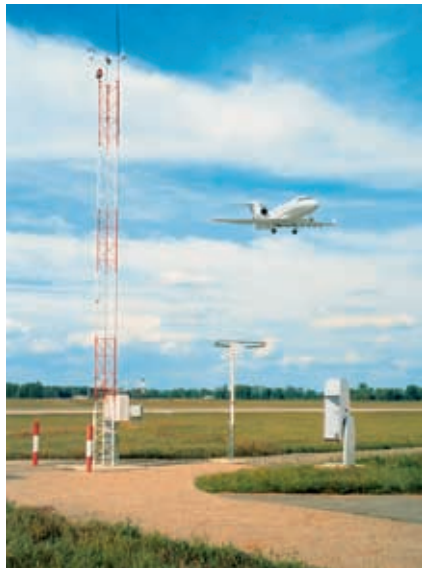
The PWD22 is recommended for Automatic Weather Observation Systems (AWOS).