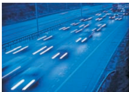
PWD12 is ideal for road weather applications.