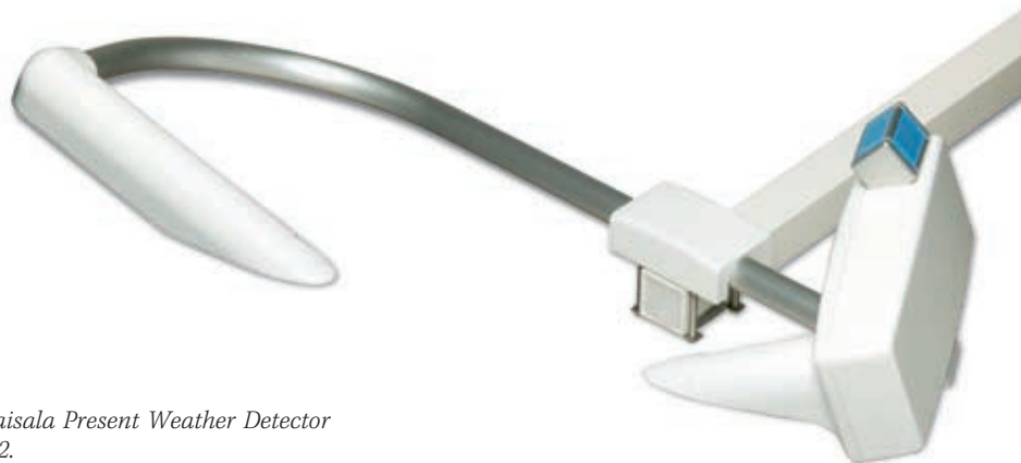
The Vaisala Present Weather Detector PWD22.

The measurement capabilities of the Vaisala PWD-series sensors can be extended when your measurement needs grow. All PWD-series sensors can be economically upgraded to ensure that your PWD sensor gives full value for many years to come.