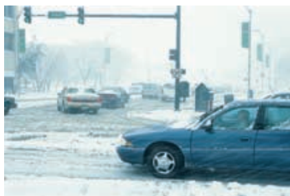
PWD-series sensors can be used in planning the road maintenance.