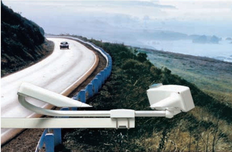
Vaisala PWD-series of present weather detectors and visibility sensors provide you off-the-shelf accuracy and reliability. They are a sensor family that grows with your needs.