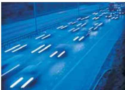
PWD12 is ideal for road weather applications.