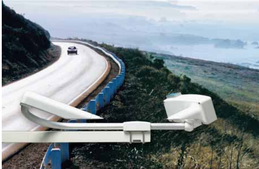
Vaisala PWD-series of present weather detectors and visibility sensors provide you off-the-shelf accuracy and reliability. They are a sensor family that grows with your needs.