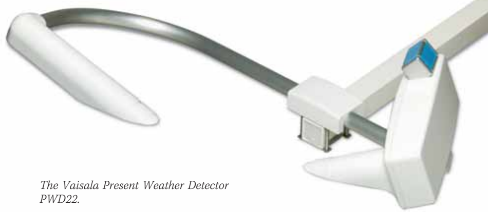
The Vaisala Present Weather Detector PWD22.