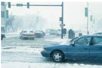
PWD-series sensors can be used in planning the road maintenance.