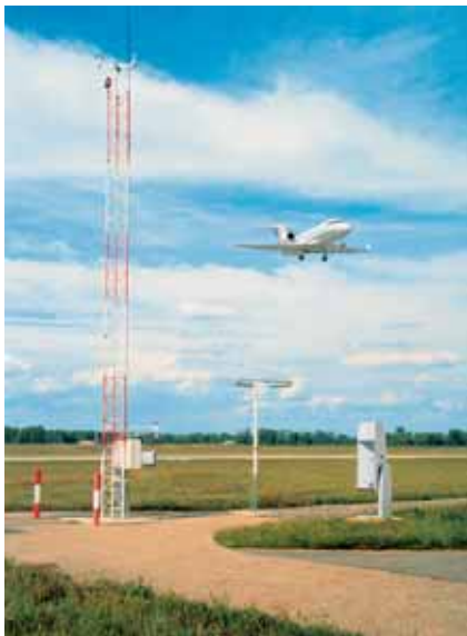
The PWD22 is recommended for Automatic Weather Observation Systems (AWOS).