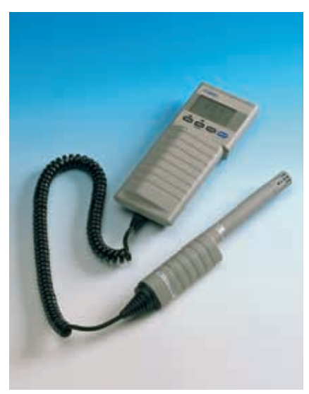
HMI41 with the HMP45 Probe.