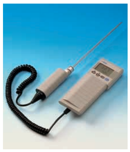
HMI41 with the HMP42 Probe.