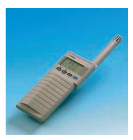
The HMI41 Indicator with the HMP41 Probe.